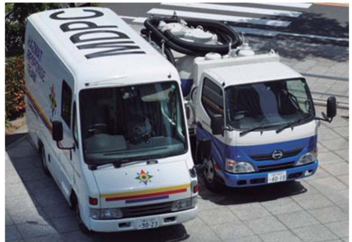
Incident Response Service Vehicles