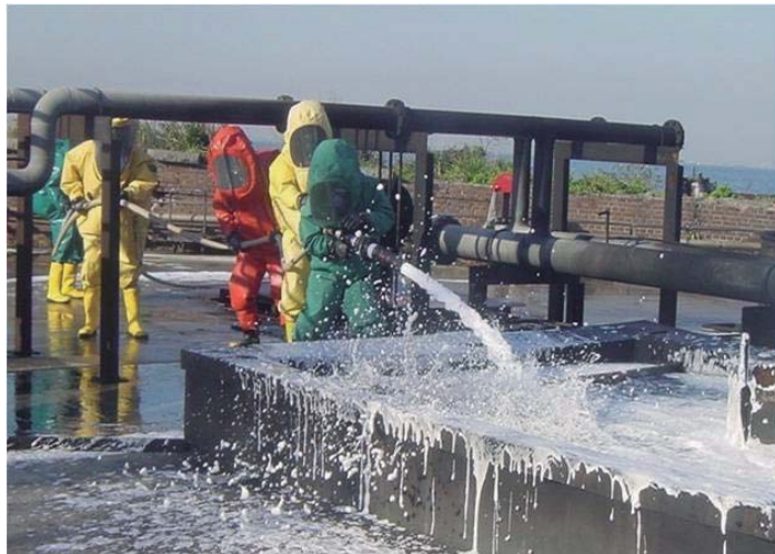
HAZMAT Response Training

In order to minimize the disaster, MDPC conducts daily training and preparation such as gas detection, firefighting, oil spill response and HAZMAT response. These training support "Preparation for the incidents". MDPC provides not only incident responses but also incident preparations including but not limited to training, and consultant for incident preparations.